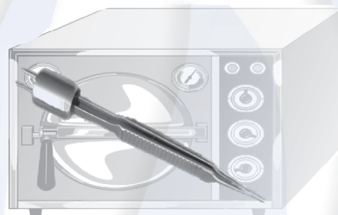
Resbond™ S5H13 Seals Bi-Polar Electro-Cauterizers